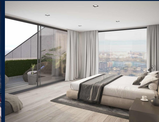
Graphene | Enigma | Element : 1 - Bedroom